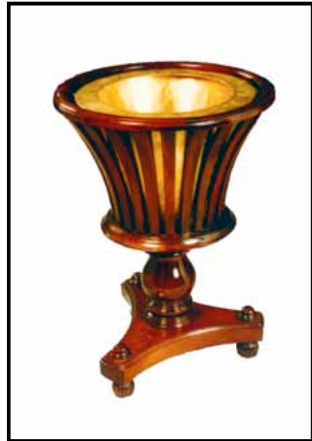
PS 041A Regency Jardiniere H. 67 W. 49