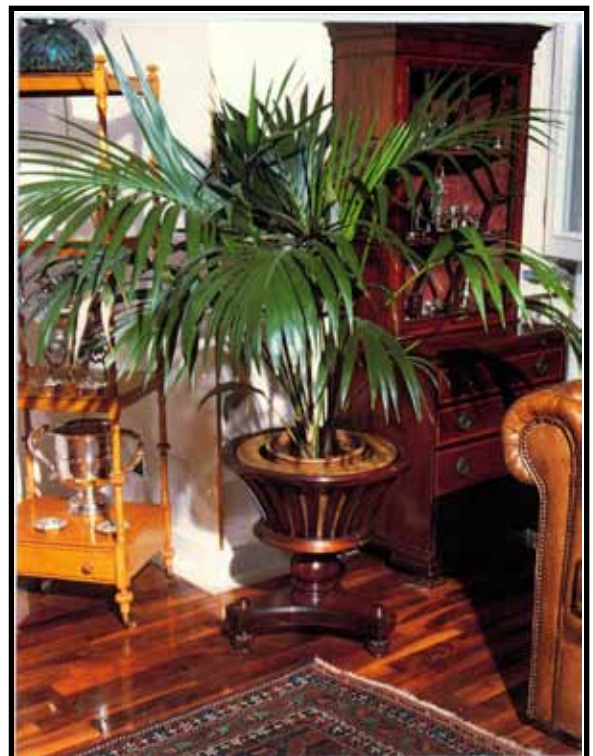
PS 041 Regency Low Jardiniere

Beautifully proportioned Late Georgian jardiniere stand of slat design on turned bun feet. Complete with hand beaten solid brass insert.