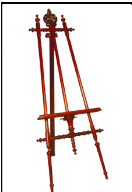
EL 007 Dutch Art Easel H. 213 D. 51