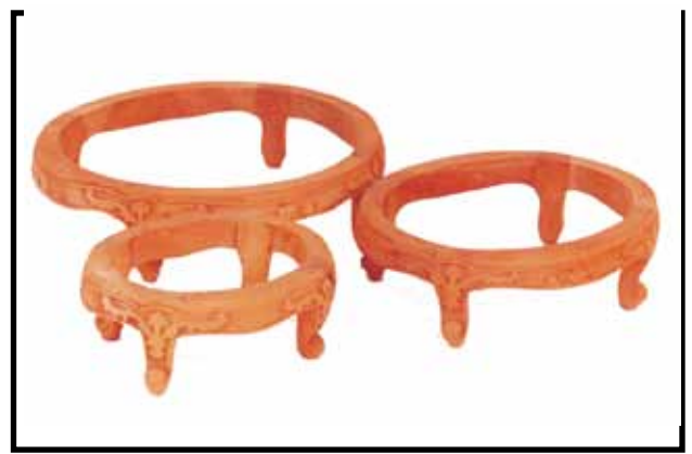
FL 019, 020 & 021 Victorian Oval Footstools Small - H. 18 W. 35 D. 31 Medium - H. 18 W. 44 D. 42 Large - H. 18 W. 57 D. 54