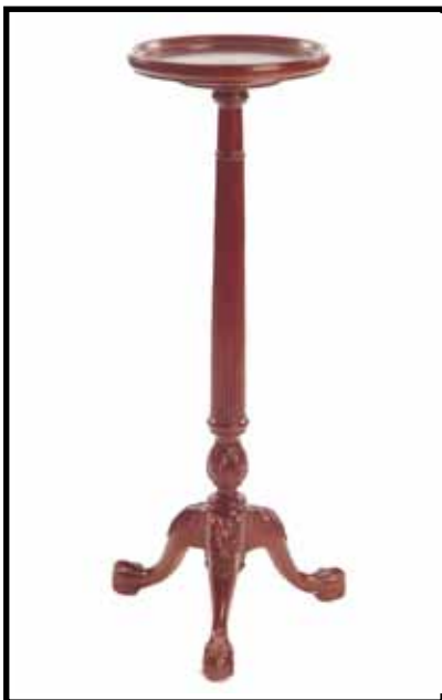
PS 016 Chippendale Palmstand H.100 Dia. 40