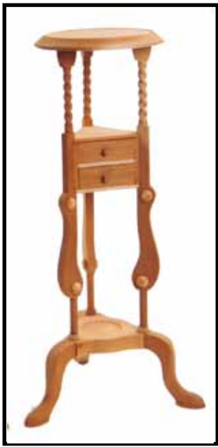
PS 033 Georgian Basin Stand H. 89 W. 47 D. 47