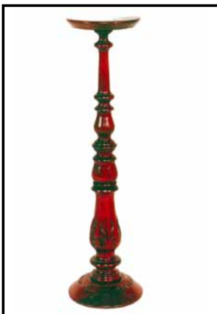
PS 001, 002 & 003 Palm Stand Small - H. 50 cm Medium - H. 75 cm Large - H. 100 cm