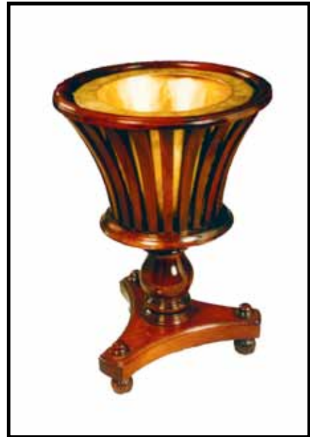
PS 041A Regency Jardiniere H. 67 W. 49