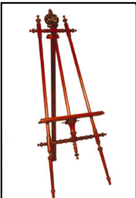
EL 007 Dutch Art Easel H. 213 D. 51