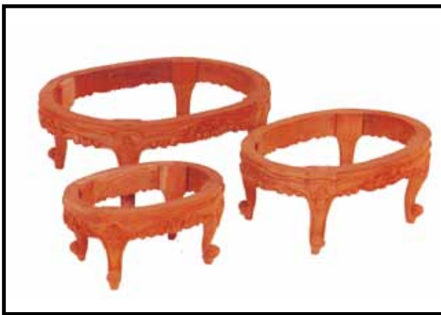
FL 001, 002 & 003 Oval Carved Footstools Small - H. 18 W. 35 D. 25 Medium - H. 20 W. 46 D. 34 Large - H. 23 W. 57 D. 43