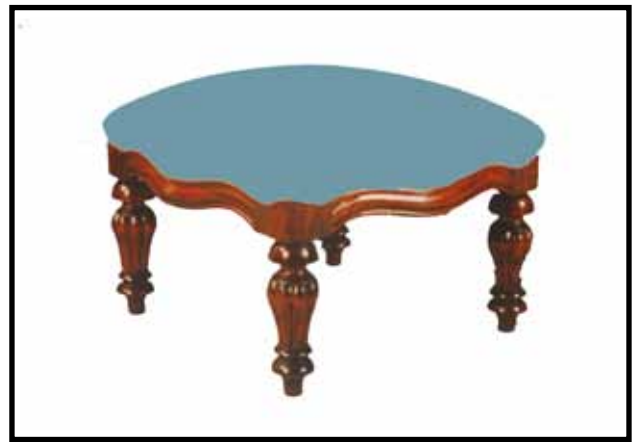
FL 008 & 009 Fluted Leg Footstool Medium - H. 28 W. 44 D. 44 Large - H. 28 W. 50 D. 50