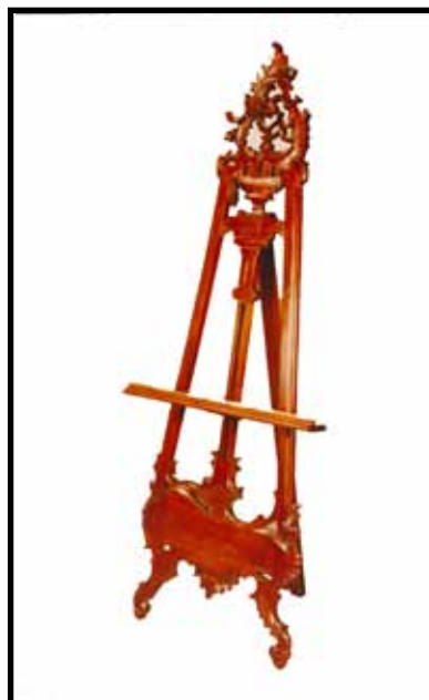
EL 001 French Art Easel H. 213 D. 51