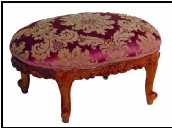
FL 003 Large Oval Footstool

Shown here in both Natural and Mahogany finish. Upholstered in fine silk damask on the large stool. The medium size upholstered with hand embroidered floral decoration on silk moire.