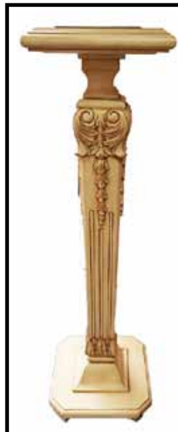
PS 065 Marcus Pedestal H. 120 W. 36 D. 36