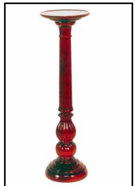
PS 005 Round Pedestal H. 100 W. 25 D. 25