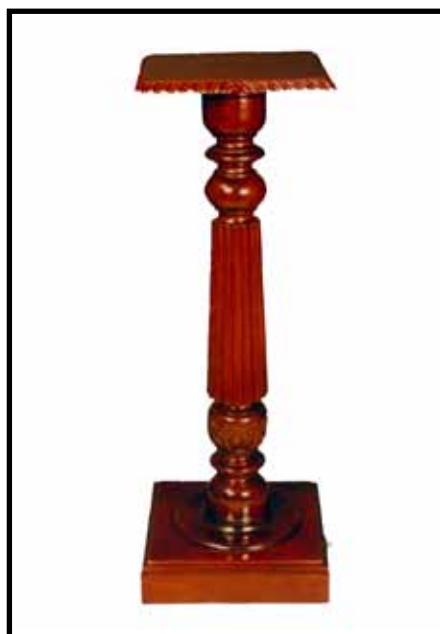
PS 006 Square Pedestal H. 100 W. 40 D. 40