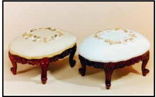
FL 002 Medium Oval Footstool

Large and medium size carved oval footstools in the Louis XV style.