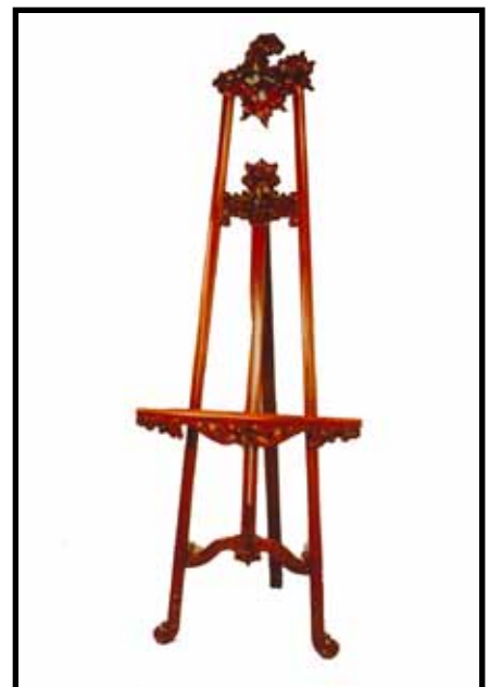
EL 003 Victorian Art Easel H. 213 D. 51