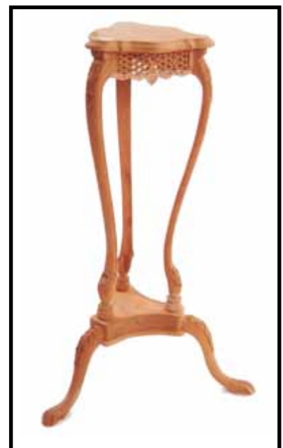
HKT 02 George II Plant Stand H. 100 Dia 40